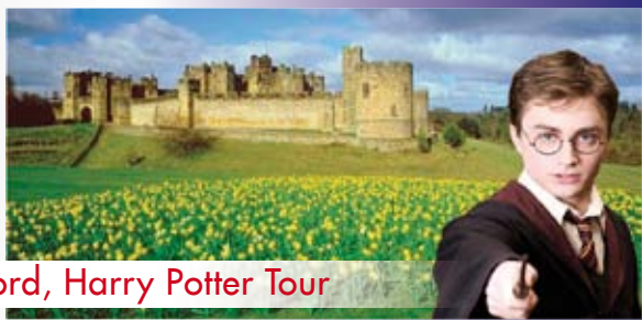
Oxford, Harry Potter Tour