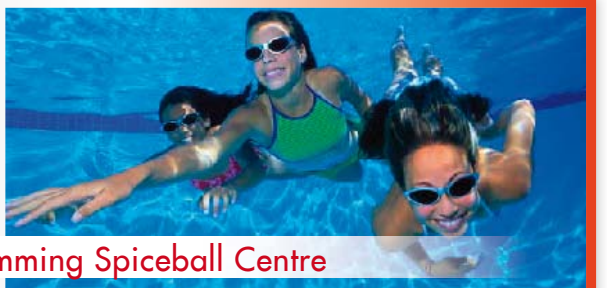
Swimming Spiceball Centre