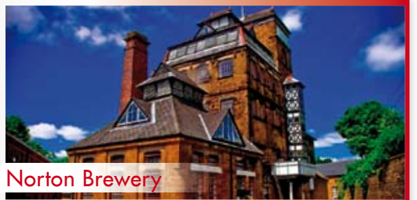
Hook Norton Brewery