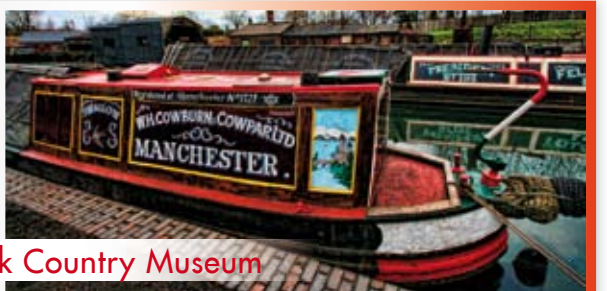
Black Country Museum