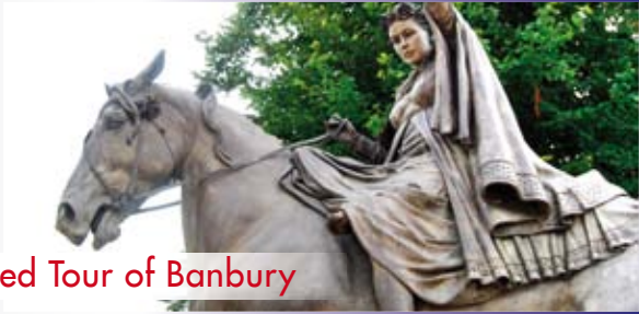
Guided Tour of Banbury

Our VISIT BANBURY programme takes you on daily escorted tours to all of Banbury's top attractions such as: