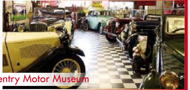
Coventry Motor Museum