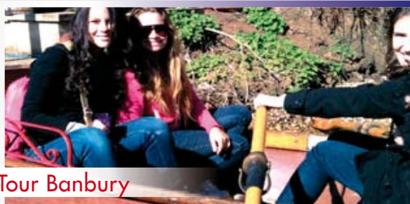
Boat Tour Banbury